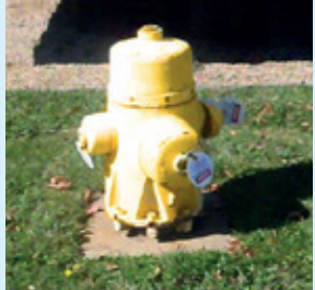
Above ground hydrant