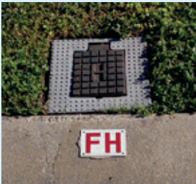
In ground valve or hydrant