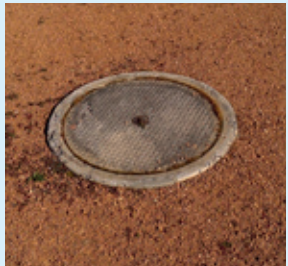
Sewer maintenance hole