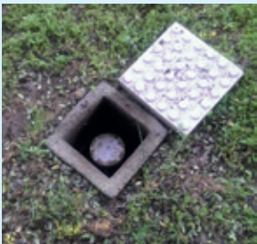
Sewer riser or inspection shaft