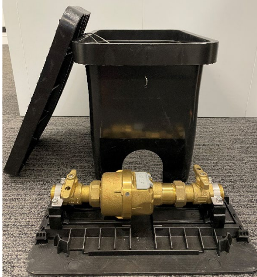
All Valve DN20 sub-meter box kit for inground installation (water meter not included)