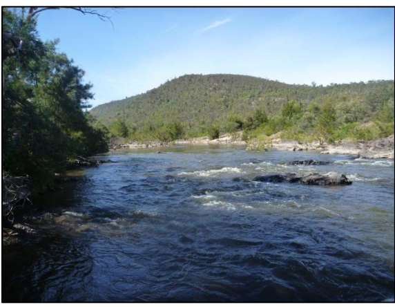
MUR 28 – Looking upstream (440 ML/d)