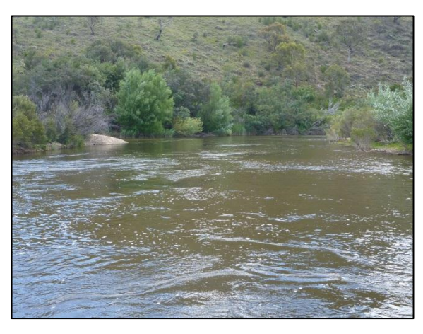
MUR 18 – Looking downstream from the riffle habitat (350 ML/d)