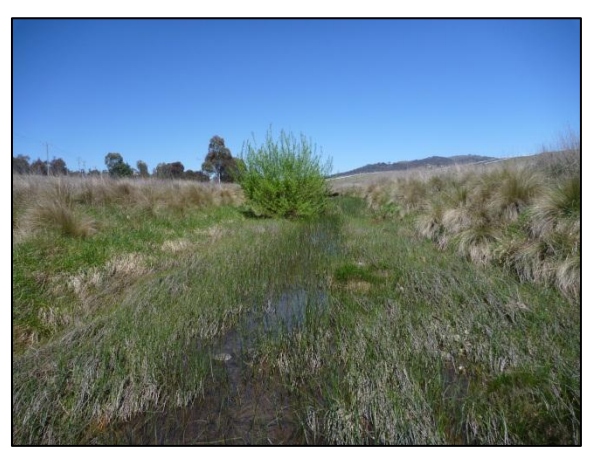
BUR 1c - Looking upstream (2.8 ML/d)