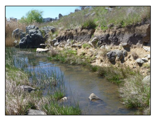
BUR 2a – Looking downstream from the riffle habitat (2.8 ML/d)