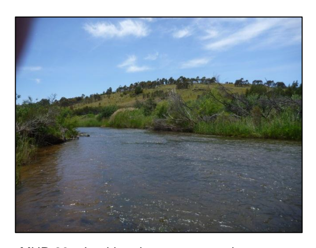
MUR 23 – Looking downstream and across to the edge habitat (440 ML/d)