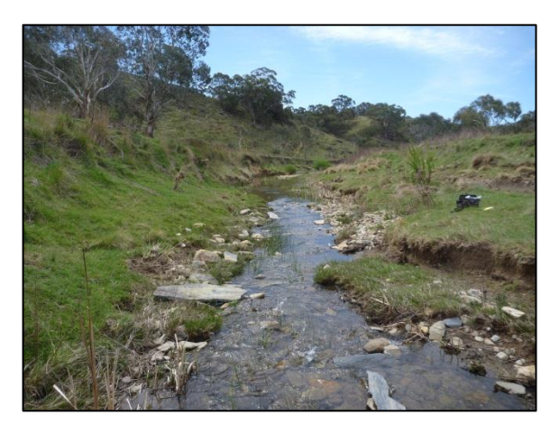
BUR 2c – Looking downstream over the riffle habitat (2.7 ML/d)