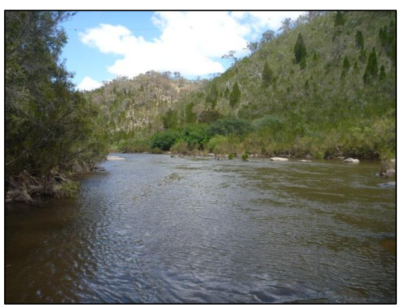
MUR 16 – Looking upstream from the riffle habitat (350 ML/d)