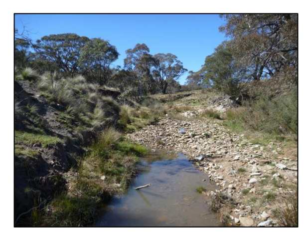
BUR1a – Looking upstream from the riffle habitat (2.8 ML/d)