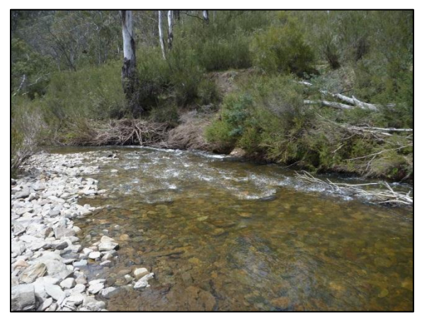
QBYN 1 – Looking downstream at the riffle habitat (90 ML/d)