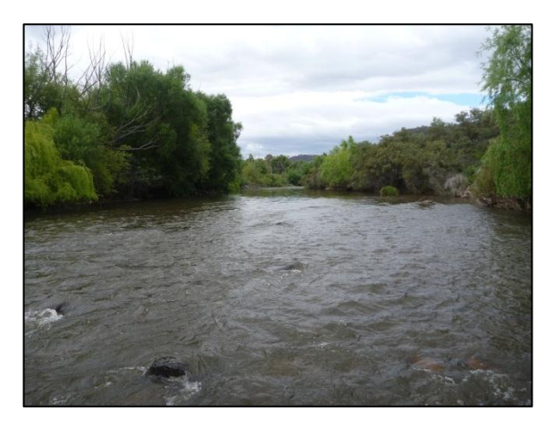
MUR 15 – looking upstream from the riffle habitat (350 ML/d)