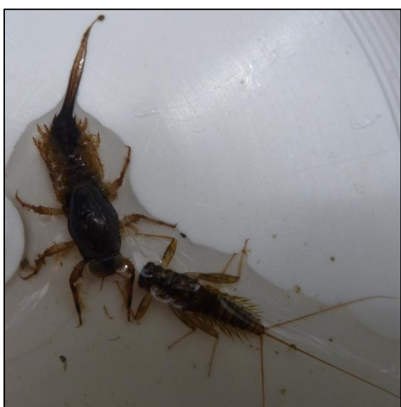
Plate 1. Photographs of a Gripopterygidae (left), and a Coloburiscidae and a Leptophlebiidae (right) collected at MUR 23 during spring 2013 sampling.