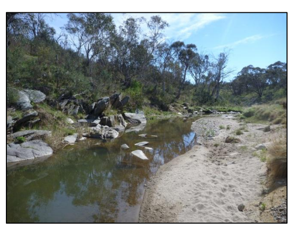
BUR 2b – Looking downstream (2.7 ML/d)