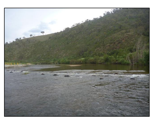
MUR 19 – From the riffle habitat looking upstream across the crossing (440 ML/d)