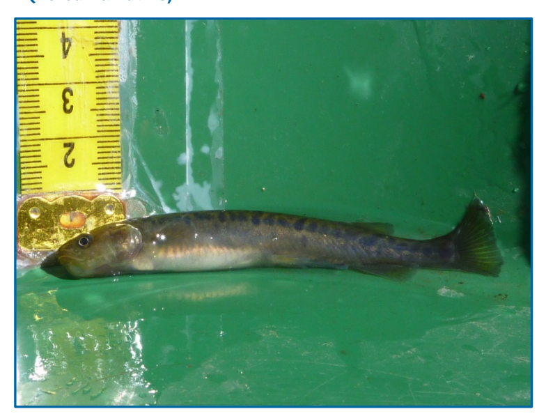
Plate 2. Mountain galaxias (Galaxias olidus)