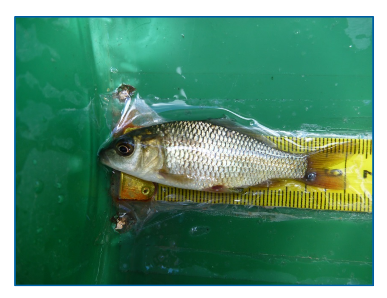
Plate 4. Common Carp (Cyprinus carpio)