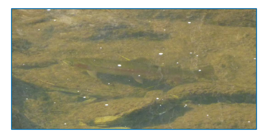
Plate 5. Rainbow trout ( Oncorhynchus mykiss ) observed in Burra Creek during June 2014