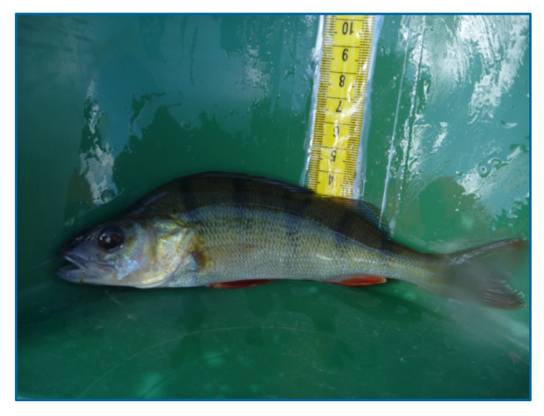
Plate 1 Redfin (Perca fluviatilis)