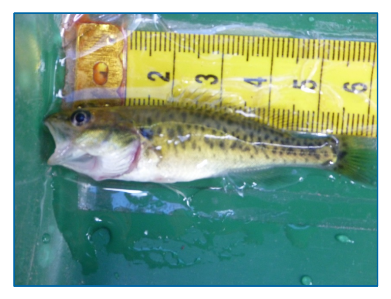
Plate 3 Murray Cod (Maccullochella peelii peelii)