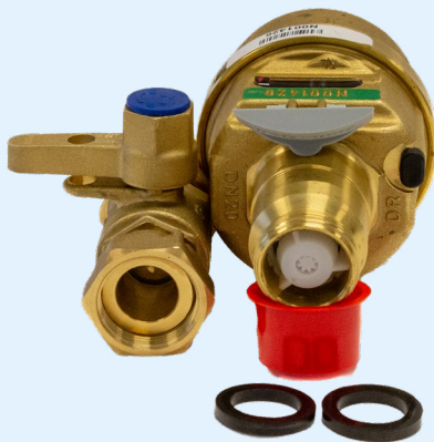
Nut and Tail water meter (new)