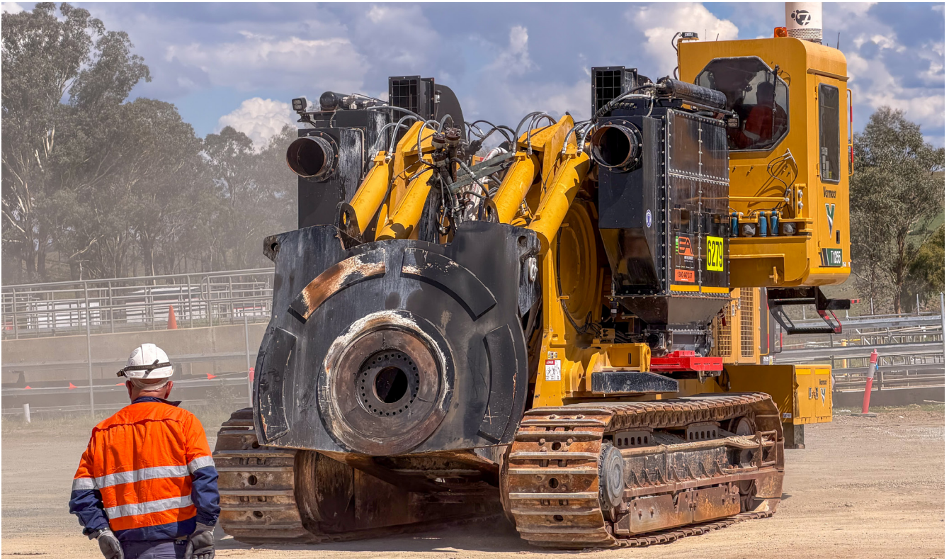
The surface miner's body before the cutting head was attached.

We will do our best to notify residents in advance of any major disruptions to traffic conditions during the construction period.