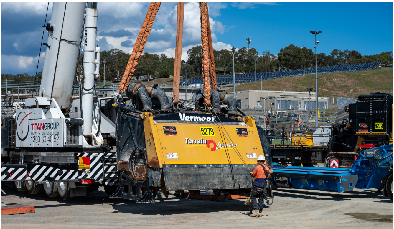
The surface miner's cutting head being offloaded by crane.

Scan the QR code for an exclusive first look at our surface miner in action!