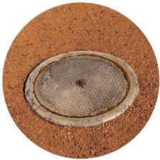
Sewer maintenance hole