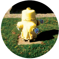
Above ground hydrant