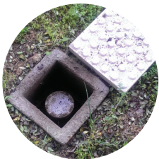
Sewer riser or inspection shaft