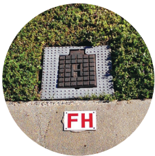
In ground valve or hydrant