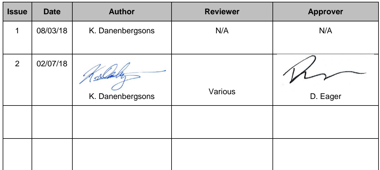
Version control table